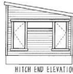
HITCH END ELEVATION