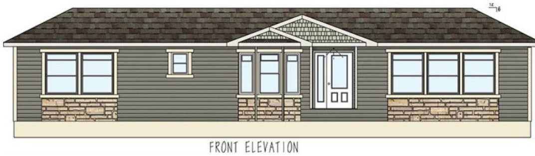
Example of Exterior Elevation