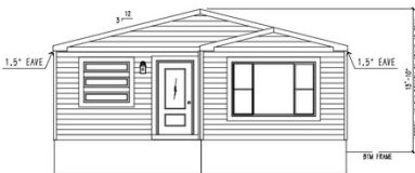
FRONT ELEVATION SCALE: 3/16"=1'-0"