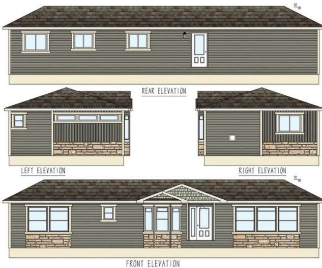
Example of Exterior Elevation