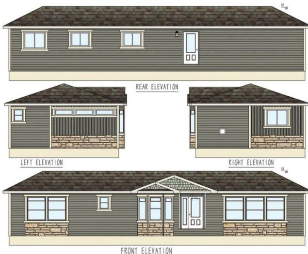
Example of Exterior Elevation