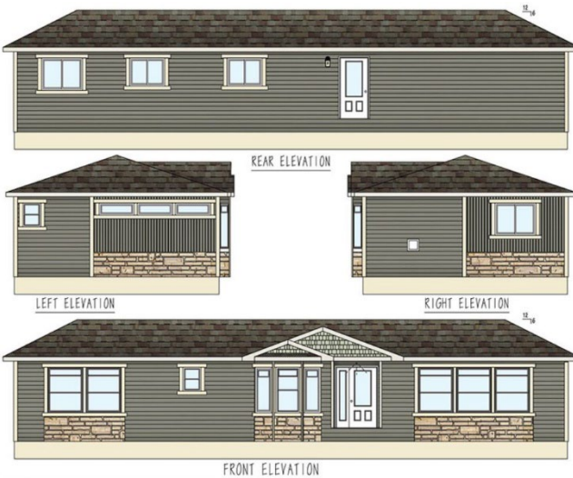
Example of Exterior Elevation